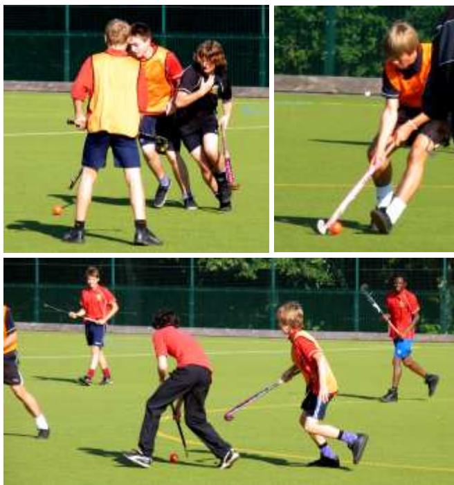
Hockey and rugby lessons at Mangotsfield