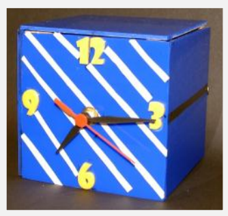
A selection of recent work from Textiles, Resistant Materials, Electronics and Food Technology Lessons