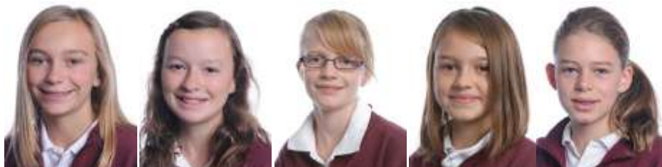
Year 8 Netball Team