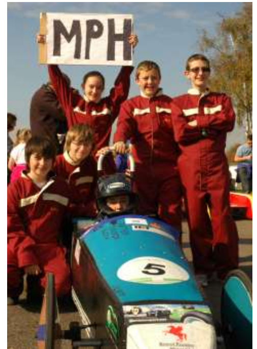
Team MPH celebrate their 9 th seeding